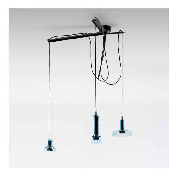
IP20 🖶 🏽 C 🗧