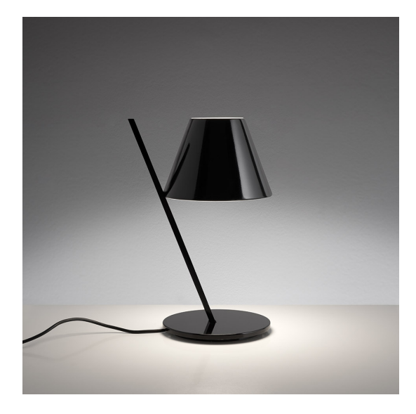
IP 20 □ ③ (€