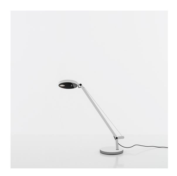
IP20 🕸 🖫 ( € Dimmerable: +0-