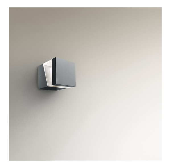
IP 65 (<u></u><u></u><u></u>