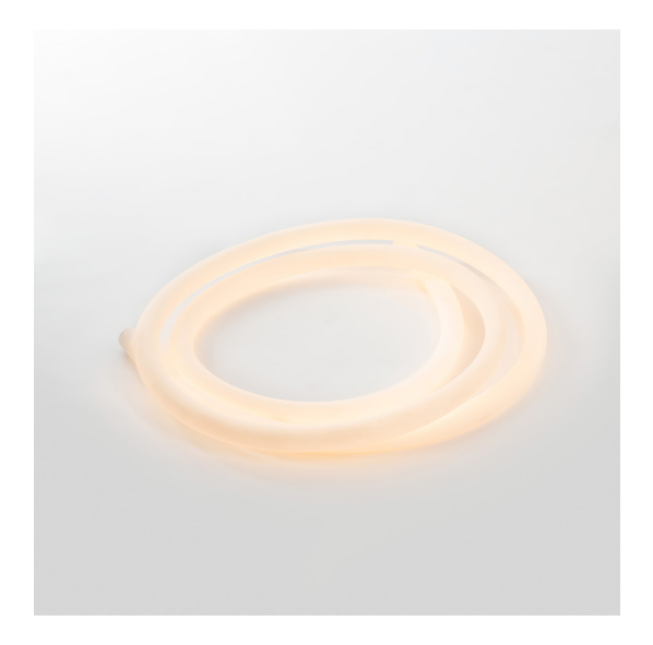
IP 65 (★ (★ Dimmerable: + 0 -