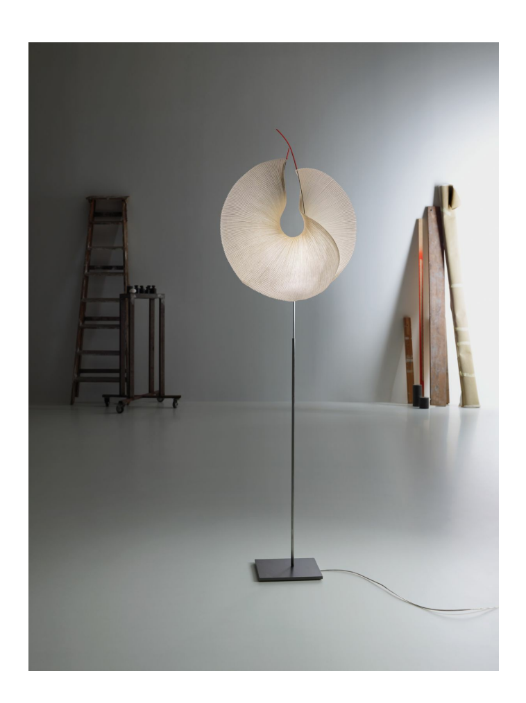
Yoruba Rose Floor INGO MAURER TEAM 2020

Paper, metal, stainless steel, silicone. Yoruba Rose Floor is a new version of the floor lamp Yoruba Rose. Just as in all other MaMo Nouchies, the lampshade consists of Japanese paper, which has to undergo a special manufacturing process in Dagmar Mombach's studio, until the desired shape is achieved. The light source is an LED module, provided with a cooling element, developed by Ingo Maurer especially for the MaMa Nouchies. Its light is so warm and soft, that any difference can hardly be noticed when compared to conventional halogen light sources.