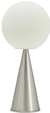
Table lamp with diffused light and dimmable by switch button. Frame made of brushed nickel-plated metal. Diffuser made of white blown glass with satin-finish. Transparent power cable, dimmer and plug. European two-pole plug. Bulb not included.

Nothing more than a sphere, set in an apparently impossible feat of balance, upon a cone that serves as the base. One of Gio Ponti's many compositional magic tricks, designed in 1932. The counterbalancing of two elementary geometric forms results in an original, perfectly proportioned object. An unpretentious composition, enriched by the extraordinary balance of its proportions and the stylish discretion of non-reflective materials. The light is diffused and valorized by the geometrical simplicity of the design. In designing Bilia, Gio Ponti imagined a smaller version in a range of "spray colours". From those handwritten notes of the original project, FontanaArte presents Bilia Mini in new breathtaking chromatic variations.