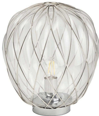
Table lamp with diffused and dimmable light. Enclosed diffuser made of transparent blown glass. Cage and base made of chromed metal. Transparent power cable, dimmer and plug. European two-pole plug. Bulb not included.

Pinecone is a suspension and table lamp. The diffuser is manufactured using the ancient caged blown glass technique: the glass maker blows the molten glass blob into a metal cage, which only partly contains the blob's natural expansion. In this way, the glass surface is partly trapped by and partly escapes the cage, generating an impression of tension as the object struggles to free itself from its harness; the cage is further enriched by the galvanic treatment that makes it look glossy and brilliant. The transparent version, in particular, reveals a two-fold structure that multiplies the scenic effect, while the metal cage pattern projects kaleidoscopic shade effects on the surrounding surfaces. On the contrary, in the white version the glass delicately envelops the cage surface and enhances its geometric pattern, generating an elegant and visually pleasing diffused light. The lighting fixture makes a highly appealing and striking impact either switched on or off.