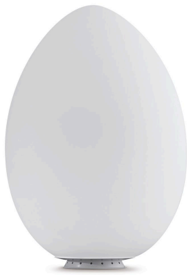
Table lamp with diffused and dimmable light. Diffuser made of white blown glass with satin-finish. Base made of white painted metal. Black power cable, plug and switch. European two-pole plug. Bulb not included.

A natural form and timeless symbol of perfection, in which symmetry and asymmetry harmoniously coexist. Designed in 1972, the 'shell' of the egg contained a light source: an ironic idea that still works today. As in nature, the shell of the Uovo lamp is the embodiment of absolute lightness, an elegant form in white satin blown glass that gives off a warm, uniform light. Available in three sizes, it has all the versatility of a collection designed for multiple uses: from the small version which serves as a tiny utility lamp to the large version, a veritable light sculpture, protagonist of any space.